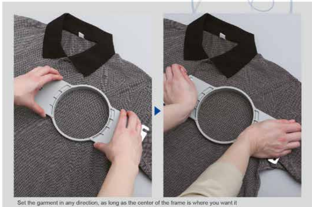
Set the garment in any direction, as long as the center of the frame is where you want it