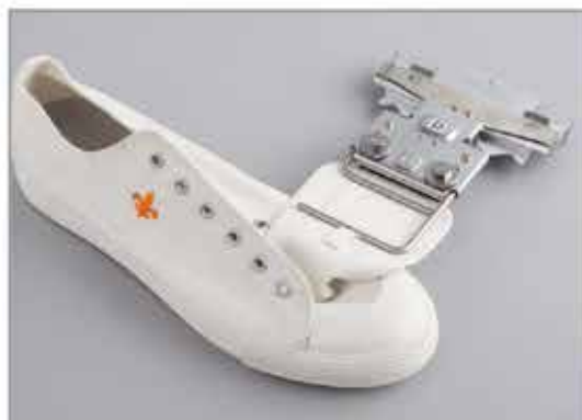
Embroider the tongues of shoes