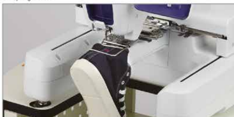
The VR is compatible with the straight type only