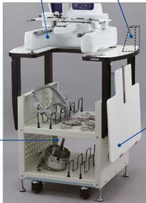
Exclusive stand with plenty of storage for various accessories