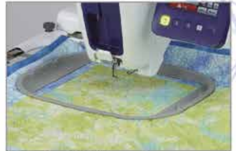
The VR offers a 200 × 200 mm sewing range

Easy-to-use stand with excellent storage capacity