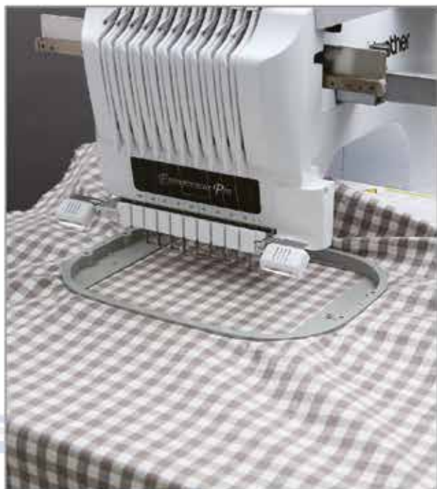
A square frame to make aligning quilt patterns and other embroidery positions