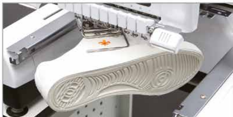
Set-up larger shoes