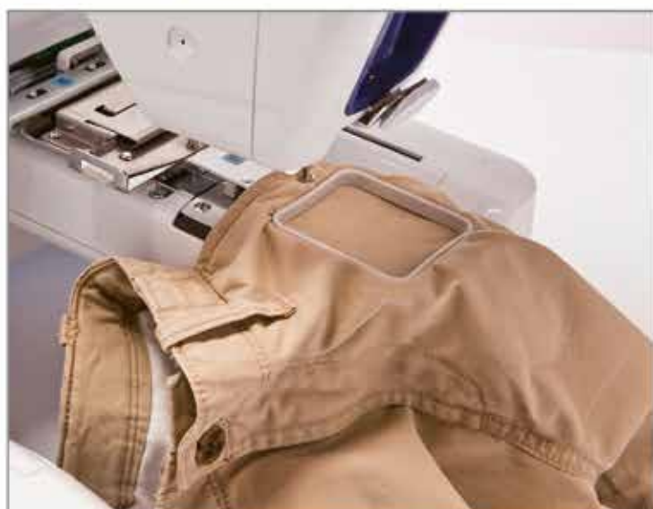
Embroidery is possible even in small spaces such as pockets, and support for automatic frame detection ensures both safety and peace-of-mind