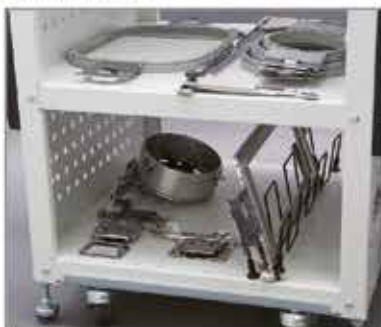
Neatly stores frames and arms