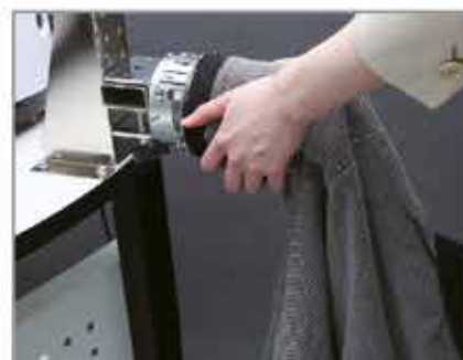
Stretch the piece over the special frame