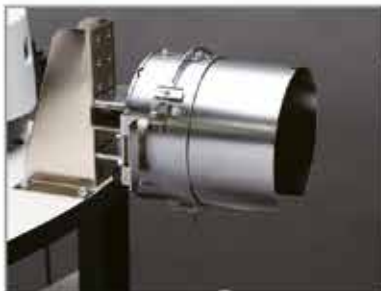
Tool attachments such as cap frames and cylindrical frames