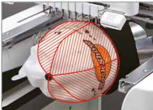
Embroider right up to the edge