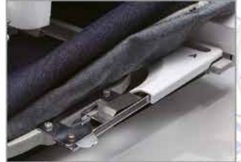
Even large pieces of cloth can be released to the upper side of the arm