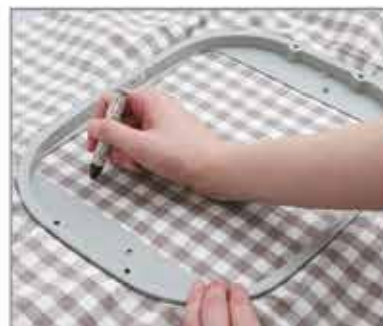
The square shape of the frame also makes it ideal for planning quilt designs