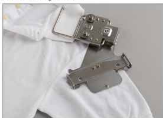
Embroider the collars of polo shirts

Embroidery is easy even for those parts that offer little stretch such as pockets