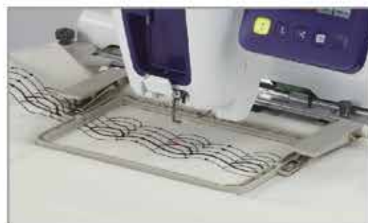
The VR offers a 180 × 100 mm sewing range

Ideal for embroidering cylindrical sections