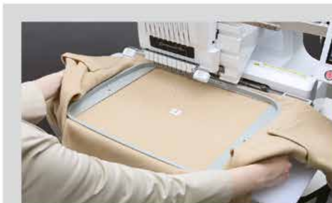
Embroider half the design with the garment framed once