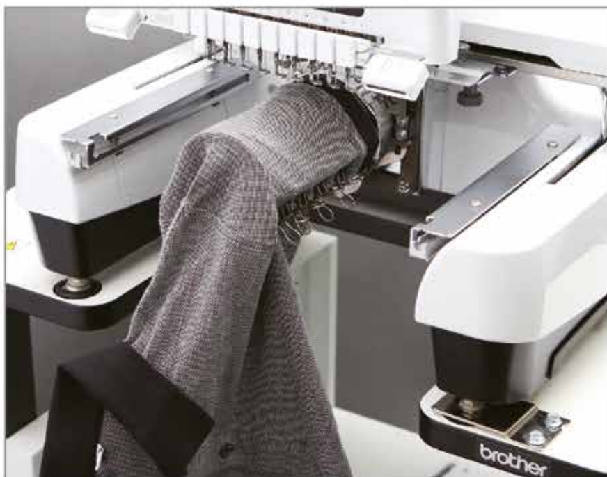
Easily embroider on shirt sleeves, trousers, bags and other similar shapes