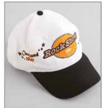
Wider area for embroidery designs

Embroider large designs by only framing once