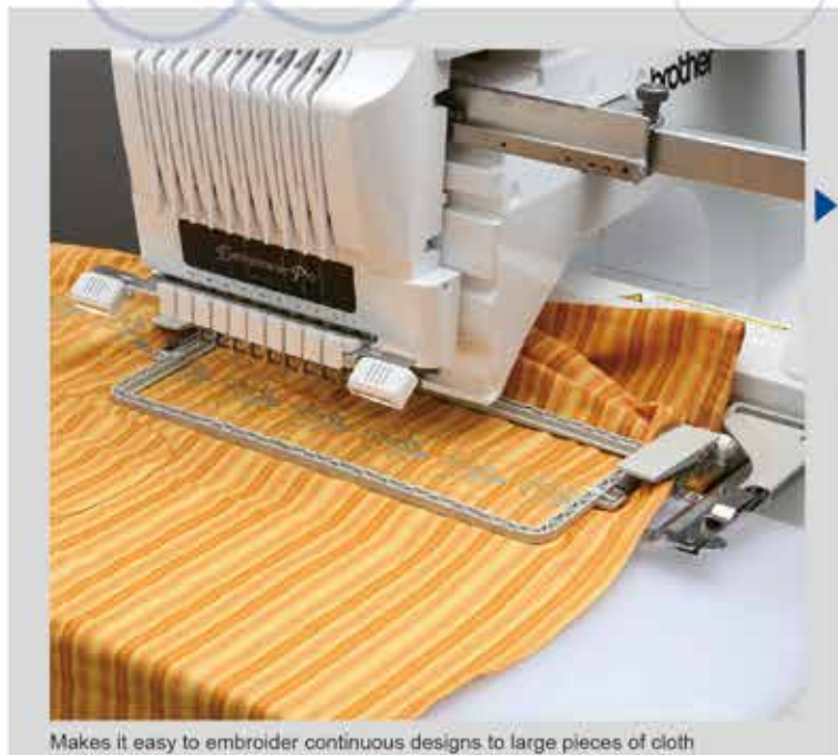
Makes it easy to embroider continuous designs to large pieces of cloth