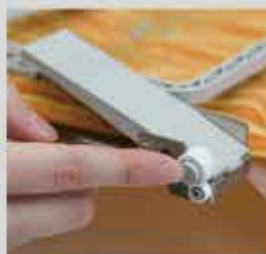
Remove the frame in one step