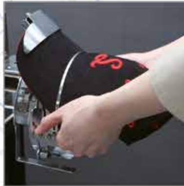
Stretch the cap over the frame