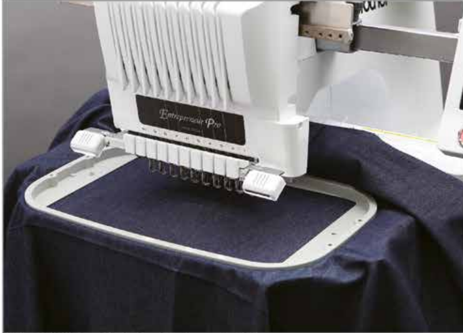
Cloth outside the frame is kept on top of the frame and out of the way