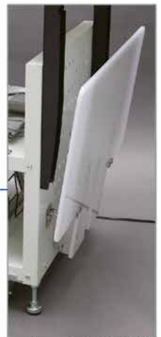
Enough space to store the wide table