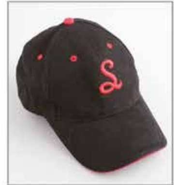
Embroider over a wider area

Embroider completed caps over a wider area