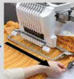
Simply slide the cloth and fit the frame