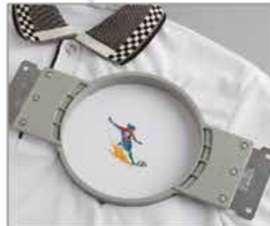
Easily adjust designs that need to be properly aligned