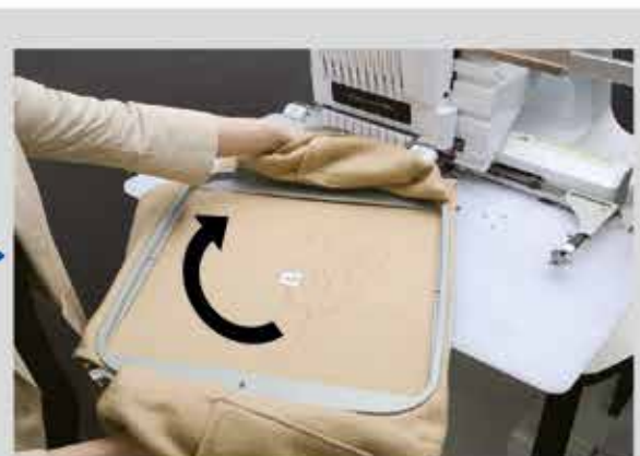
Rotate the frame when half the design is completed