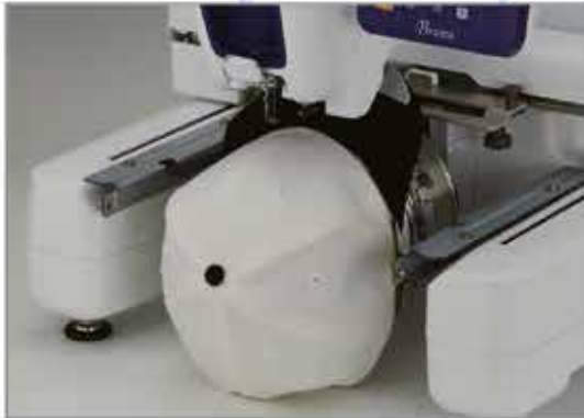
Set up the completed cap directly onto the machine