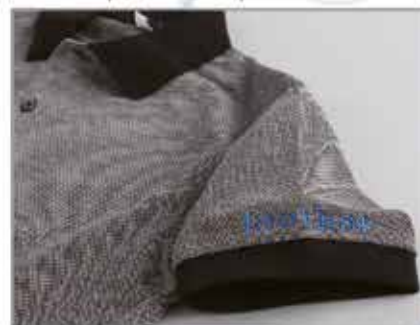
Embroider just around cuffs